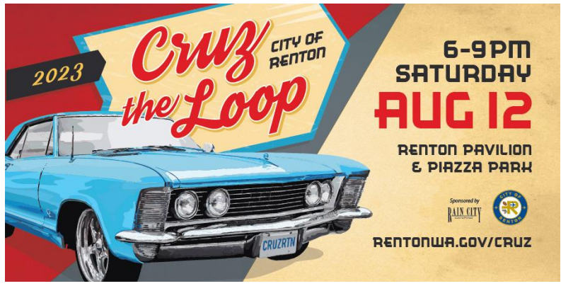
Cruz the Loop returns to downtown Renton

The iconic "Renton Loop" was historically the circuit for Renton teens and their hot rod .